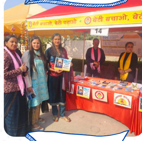
BETI BACHAO BETI PADHAO